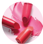
Cosmetic & consumer products